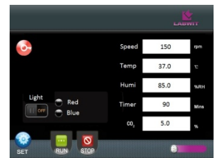
Touch Screen Control Panel

Intelligent: Self diagnostic alarm system monitors all functions and parameters and prompts in case of errors, which are clearly indicated in the touch screen panel.